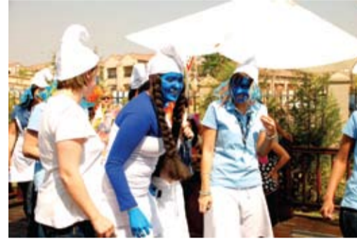
The Finance smurfs won third prize