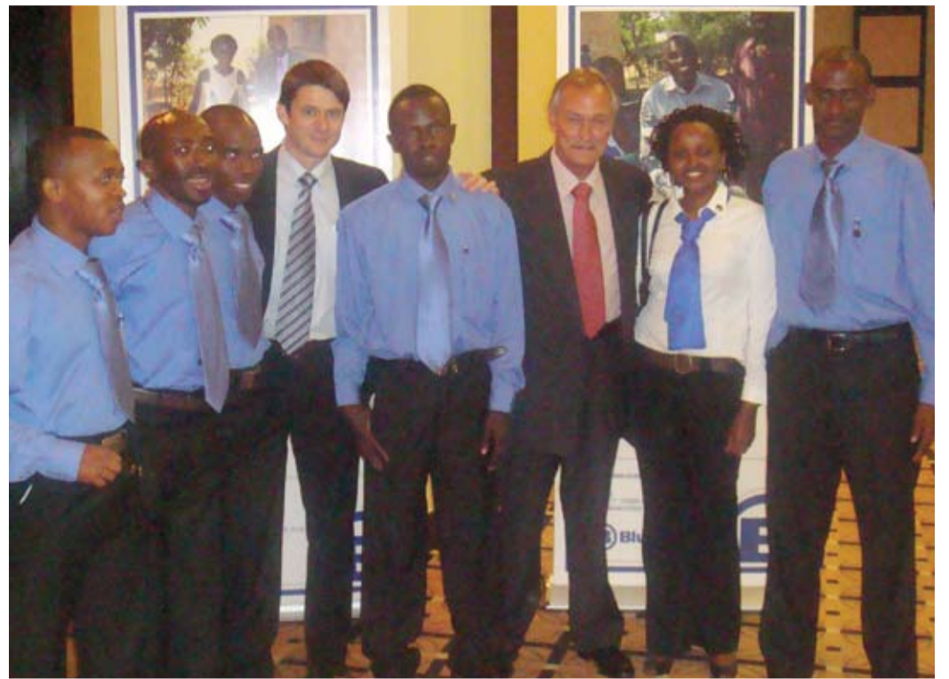
The Blue team in Rwanda at the Kigali briefing session.

The Rwandan government is strongly committed to economic recovery and attracting foreign investment. It has embraced an expansionary fiscal policy to reduce poverty by improving education, infrastructure, and pursuing market-orientated reforms, though energy shortages and lack of transportation hamper growth. Blue is delighted to be able to assist Rwandan people with financial services which are often the key to economic resurgence.