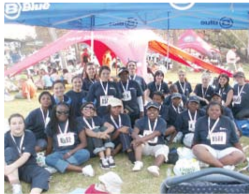
The Blue team with their medals after the Fun Run

and Blue HR written on their cheeks. The day was amazing. We were all keen to go for gold, but there were too many ladies in the way!"