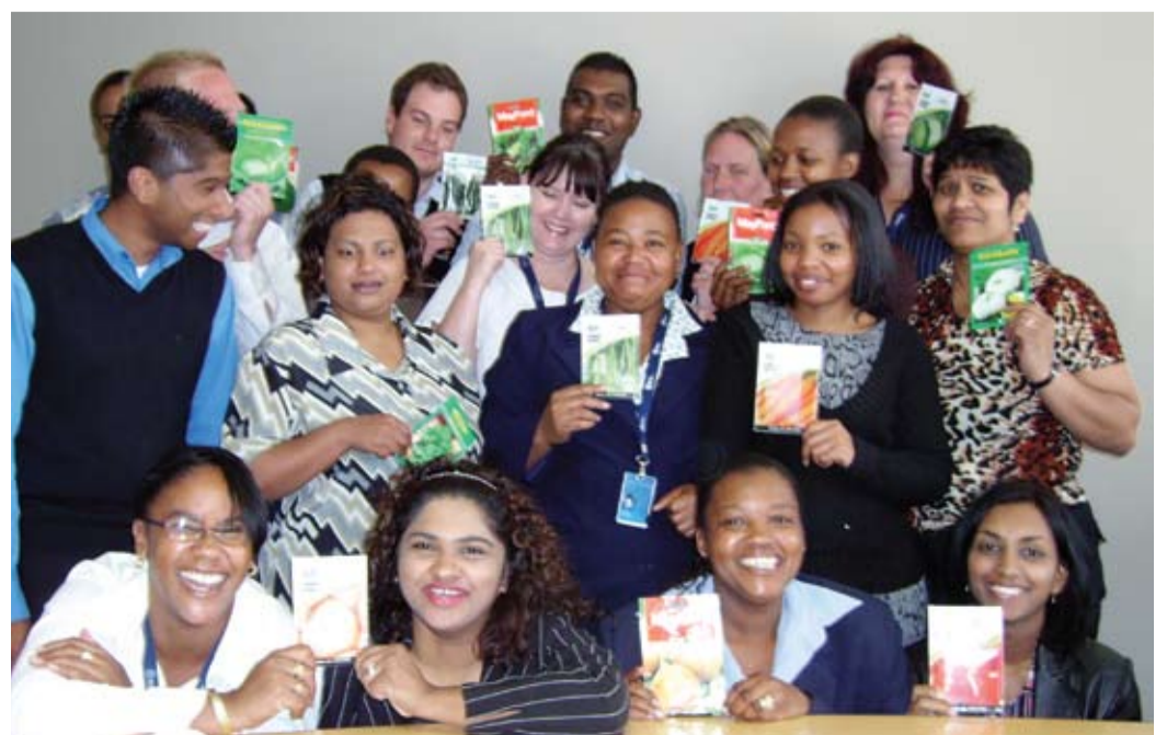
The Collections Team with their seed contributions

for seeds within a day. Priscilla says, "I thought if we all gave R10 it would make a difference. So everyone in our division gave what they could, and the R290 bought plenty of packets of seeds!"