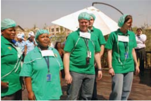
The Support team dressed as doctors

After the winners were announced, everyone enjoyed a light lunch, while taking in some welcome sunlight after the winter.